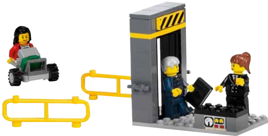
Suggested model solution