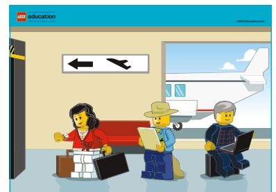
Use the illustration to support the Connect story